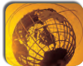
Remote Device Management