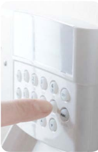
Smart Energy Home